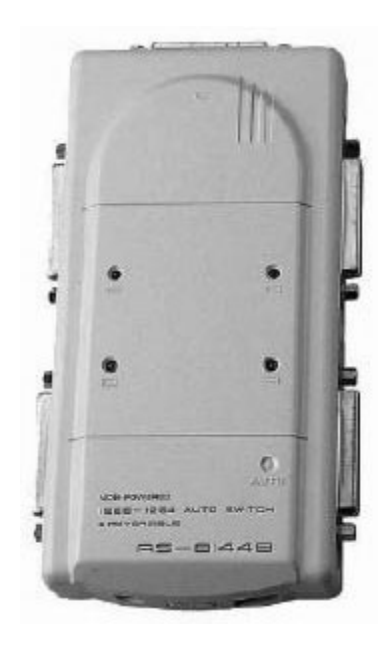
AS-8144B/AS-8441B User's Manual

Read this manual thoroughly and follow the installation procedures carefully to prevent any damage to the unit and/or the devices it connects to.