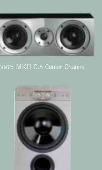
POINT5 MKII stan (optional)