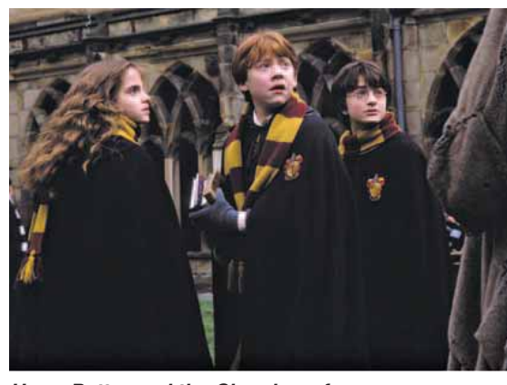
Harry Potter and the Chamber of Secrets could have been designed as a home theater demo disc, and the Atlantic Technology System 4200 met every wizardly challenge.

with crossover and level settings. I set the 642 SB subwoofer's Lowpass switch to Bypass, skipping its onboard crossover in favor of my preamp/processor's, which I set to 80 Hz. After I balanced levels, the system sounded perfectly integrated. The languid, but incredibly solid bass on "Snowbound" was deliciously rich and punchy, yet with the superb definition and "quickness" that only an excellent sub and an expertly matched sub/sat system can achieve.