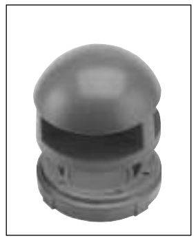
ATS183GS(8) surface mount base and speaker/transformer unit