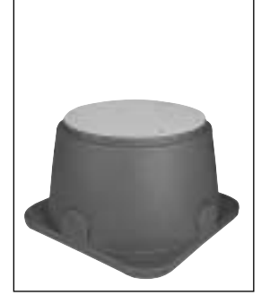
ATS100GL(8) landscape base shown with included yellow "under construction" base opening protector