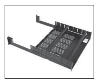
SH15-2 (with optional SHRSB2 and SHCK)