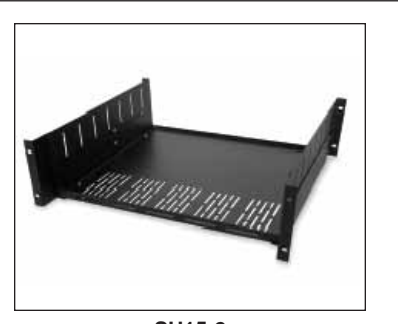
SH15-2 (w/o Accessories)