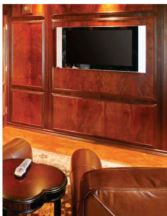
Boardrooms generally require the 1365, while the 9A60 is more suited to home use.