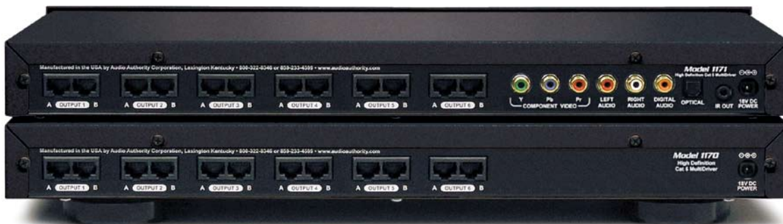
1171 rear panel

The Model AVM-71 SixDrive™ incorporates the key signal paths necessary for premium audio and video distribution systems. Consisting of an 1171 MultiDriver and six 9879 Wallplate Receivers, the AVM-71 system distributes component video at resolutions up to 1080p, as well as both digital and analog audio, over two inexpensive, easy-to-install Cat 5 cables from a single source to each of six outputs. 1170 MultiDriver Expanders and additional Wallplate receivers can be added to expand system capacity to a maximum of 42 zones. Audio Authority's Active Gain Equalization (AGE) technology and unique cable length compensation allows adjustment for the optimal signal strength at any distance up to 1,000 feet from the source, faithfully preserving the signal's original color and detail.