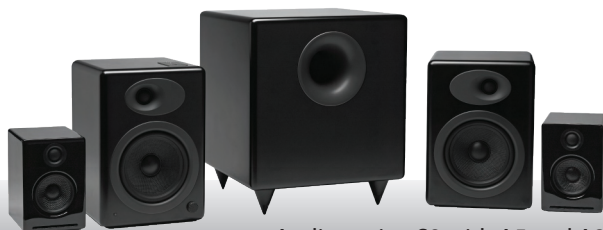
Audioengine S8 with A5 and A2