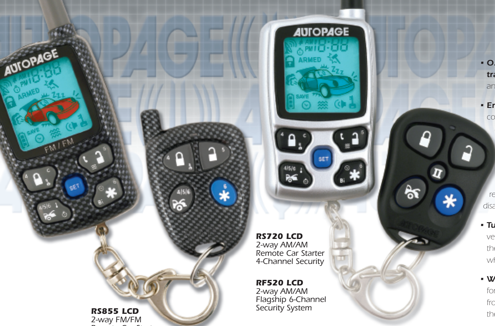
RS855 LCD 2-way FM/FM Remote Car Starter 6-Channel Security