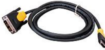
DVI to HDMI Cable (For Player)