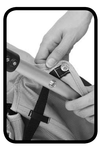
1 Secure seat fabric to frame by lining up snap placement on frame and fabric.