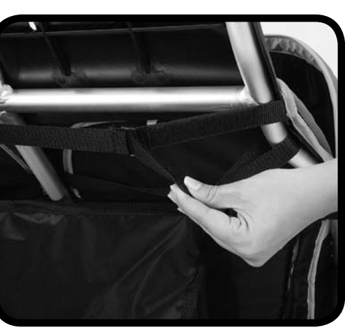
2 Secure seat straps around the bottom of the frame, behind the front wheels. Thread one seat strap through the D ring of the other strap, and fasten both Velcro sides firmly together.