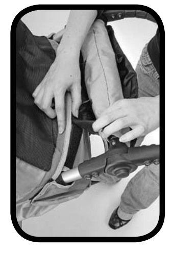
4 Once canopy is in place, attach the console by aligning the velcro strips on the console and canopy.