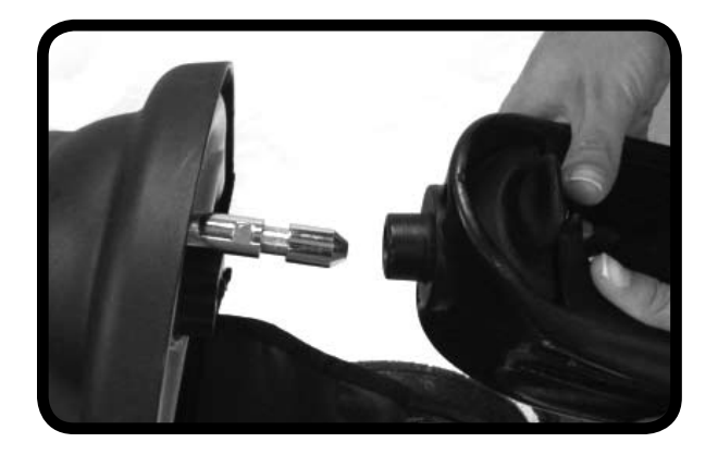
1 To install front wheel, lay stroller back so the handle is resting on floor.