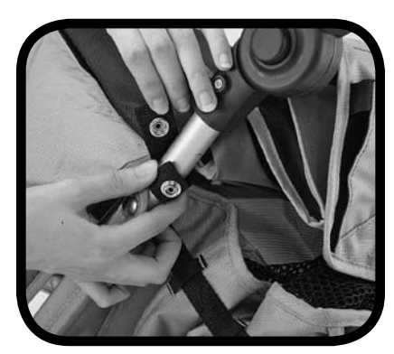
2 Snap webbing together around top of frame.