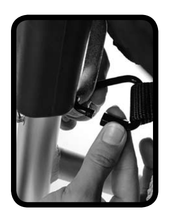
4 Be sure that fold strap rings are secured to the frame before use.