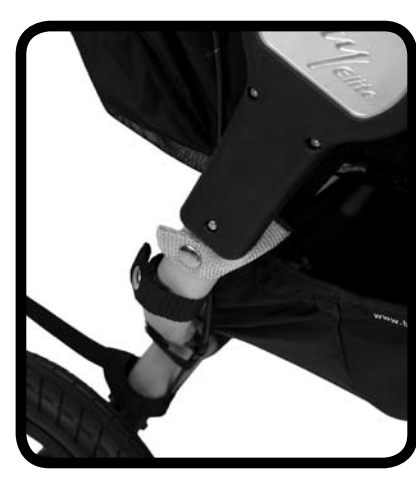
3 Secure safety straps to both sides of the frame before use.