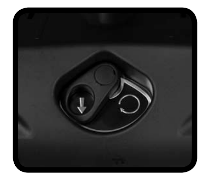
Front Wheel Locking Lever Turn to the left to lock front wheel. Turn to the right for swivel action.