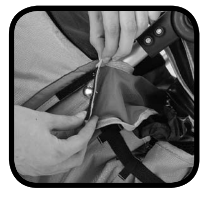
3 Secure canopy around frame with velcro tab.