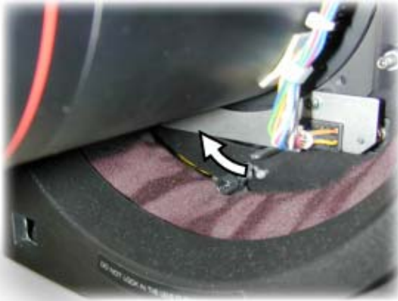
Image 1-2 Move the handle of the lens anchor system to the left