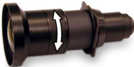
Image 1-5 Rotate the lens barrel for picture focusing