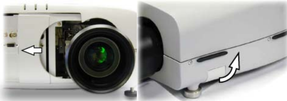
Image 1-2 Release the lens by pulling the unlock handle