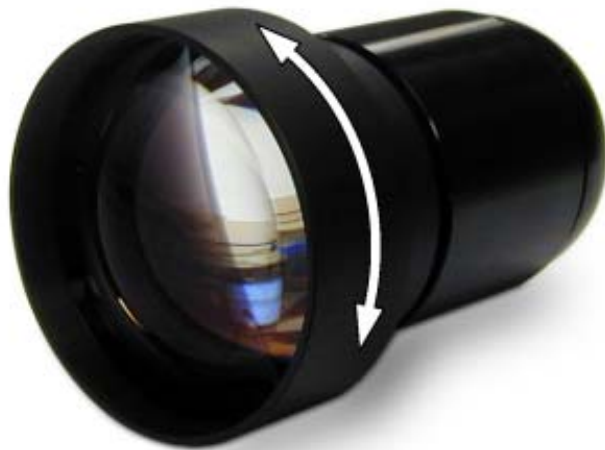
Image 1-3 Rotate the lens barrel for picture focusing.