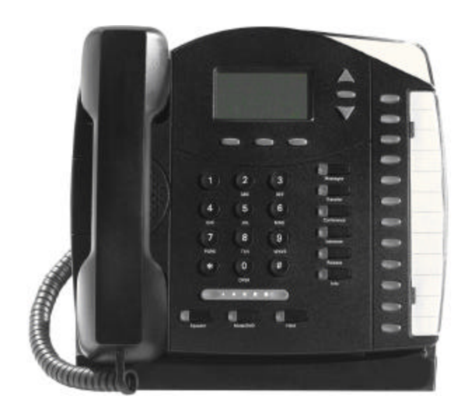
Model BizTouch™ IP 2