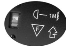
Figure 1 - AC Voltage Switch

Not all fixtures have a voltage select switch. Please be sure to connect to the proper voltage.