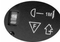
Figure 1 - AC Voltage Switch

Not all fixtures have a voltage select switch. Please be sure to connect to the proper voltage.