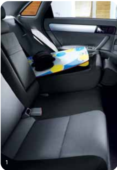
1. 60/40 splitting rear seats allow the transport of long objects

And there is more, the Optra Magnum has an ingenious array of storage places from generous map pockets to a compartment in the glove box that cools your drink, a definite delightful addition to your overall motoring experience.