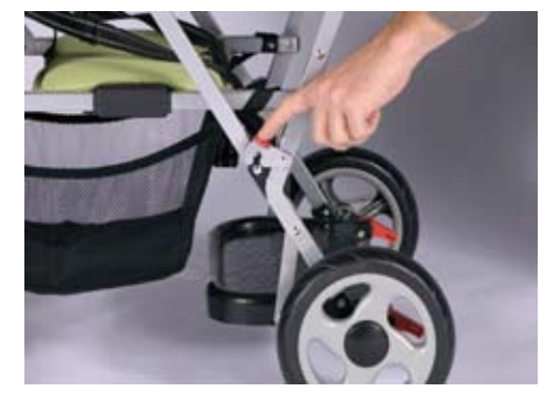
Figure 2 Figure 3