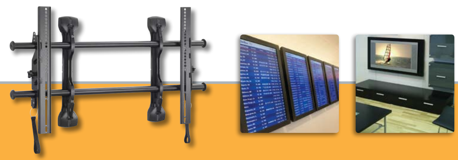
FIXED & TILT MOUNTING SOLUTIONS

Chief's Fusion—Series of installer-inspired fixed and tilt flat panel IV mounts solve the top flat panel installation problems. Innovative features like Centerless™ lateral shift and ControlZone™ height and roll adjustment provide perfect TV placement, and reduce installation time. A full line of supporting accessories can be integrated in a wide variety of AV configurations.