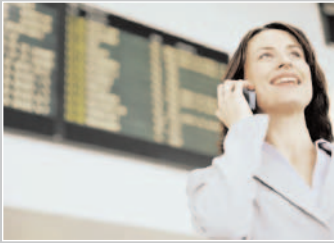
Ideal for dynamic retail displays or transit scheduling applications.