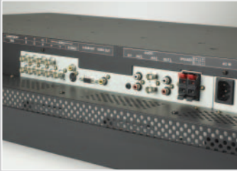
Discreet rear placement of connections and controls keep installations clean and secure.