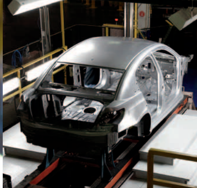
DESIGNED, BUILT, AND DELIVERED IN DETROIT