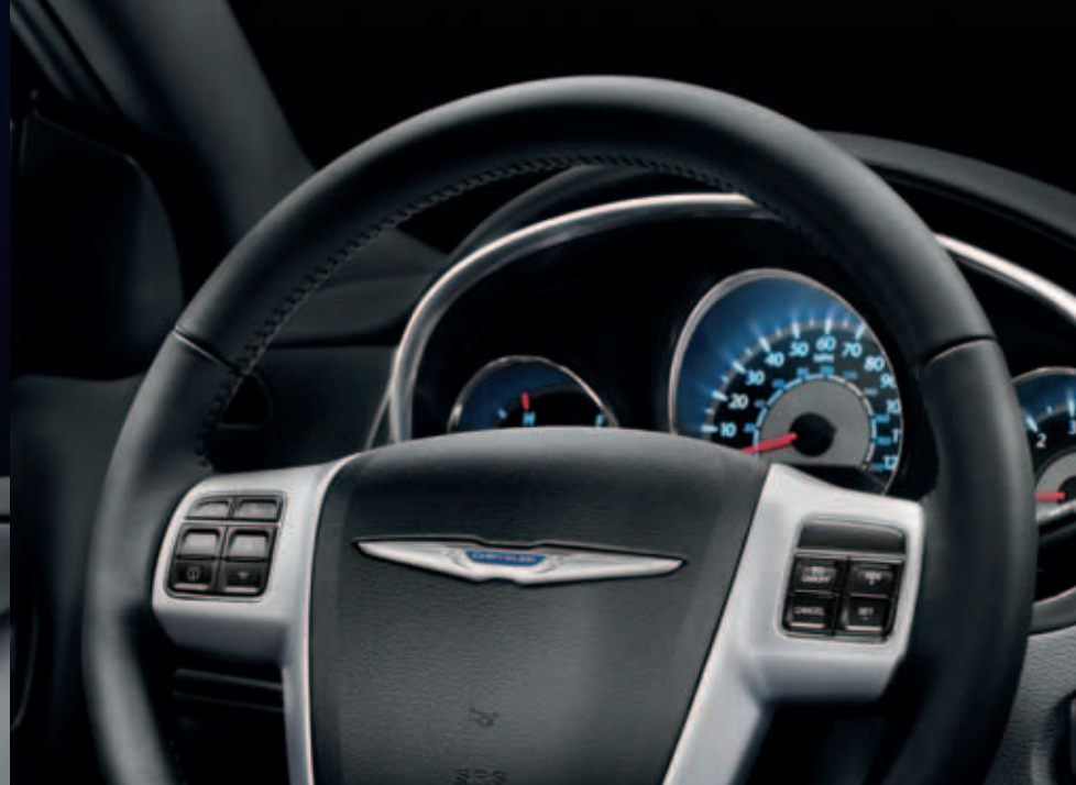
TILT/TELESCOPING STEERING COLUMN WITH INTEGRATED CONTROLS IS STANDARD