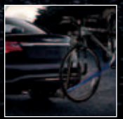
Hitch Receiver and Hitch-Mount Bike Carrier