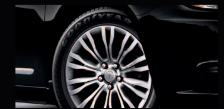
18-INCH POLISHED ALUMINUM WHEEL Standard on Limited