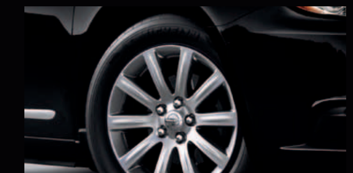
17-INCH ALUMINUM WHEEL Standard on Touring