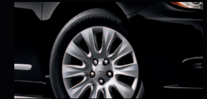
17-INCH WHEEL COVER Standard on LX