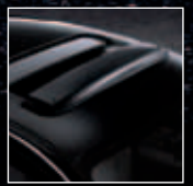
Sunroof Air Deflector

Enhance your new 200 with sophisticated style, premium protection, and engaging entertainment, knowing that every accessory meets Mopar's stringent guidelines for fit and finish. Choose from a vast array of selections designed with purpose, specifically for your 200 such as: Katzkin Leather Interiors, Ambient Light Kit, Sport and Cargo Carriers, Electronics, as well as those accessories shown at right. For the full line of accessories, visit mopar.com .