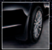
Molded Splash Guards