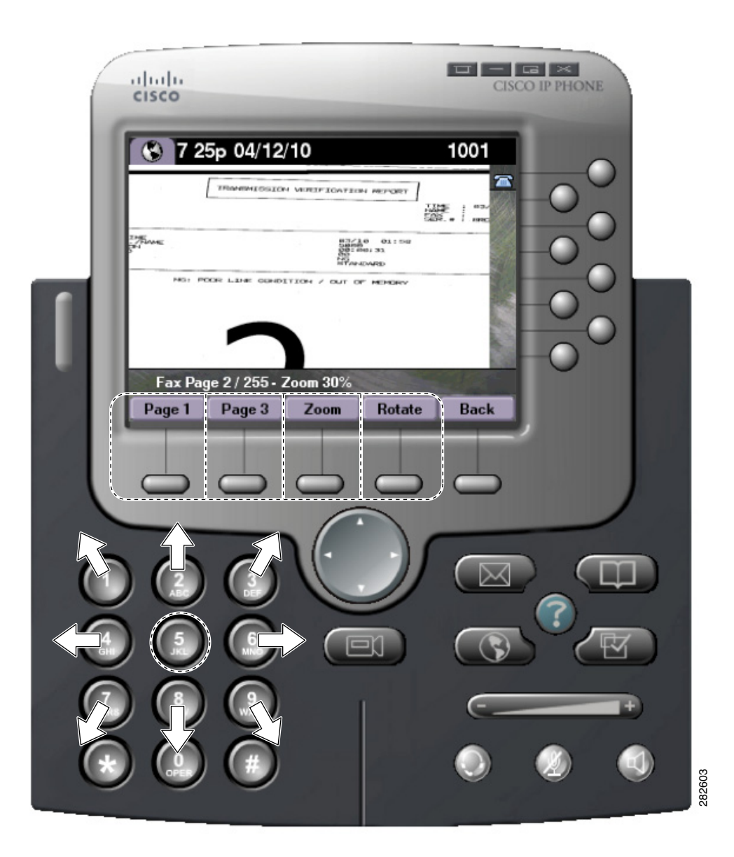
Figure 1 Fax Preview Control Buttons