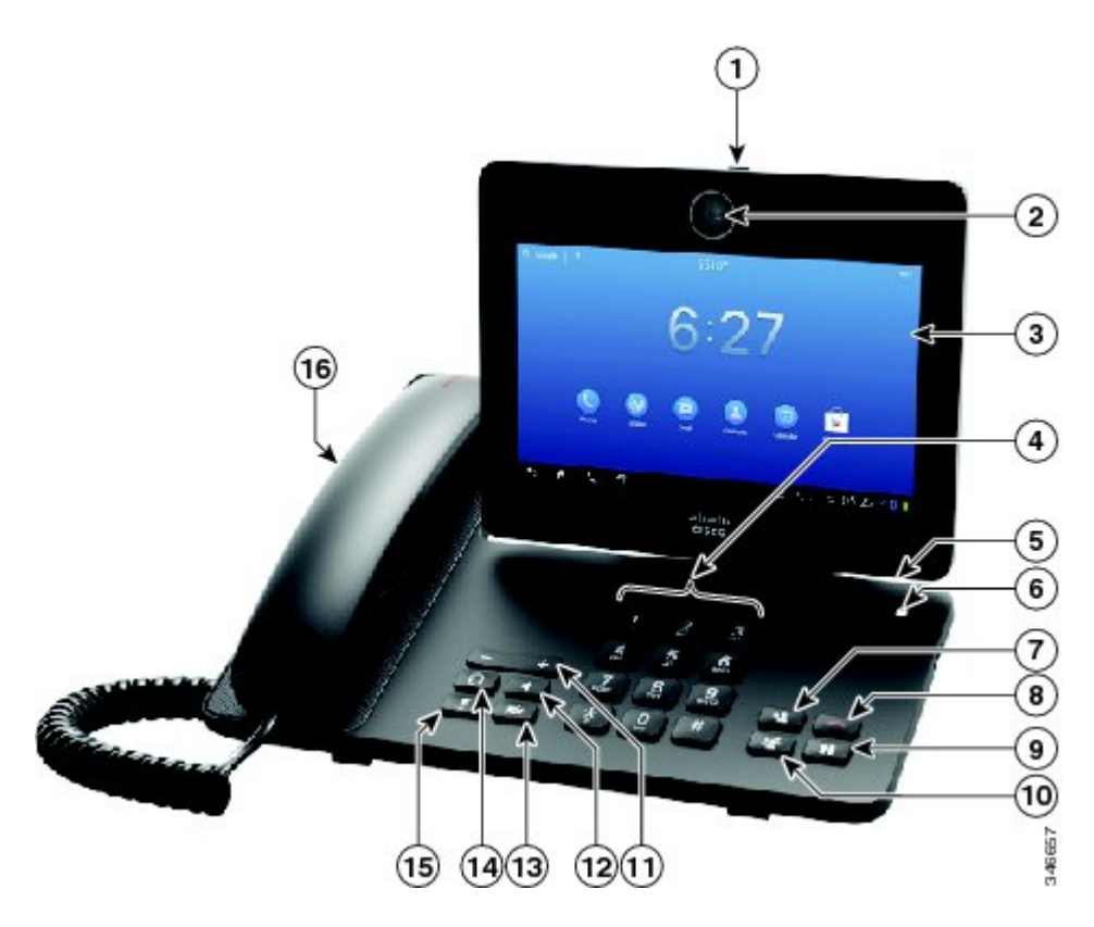
Table 1: Phone buttons and hardware