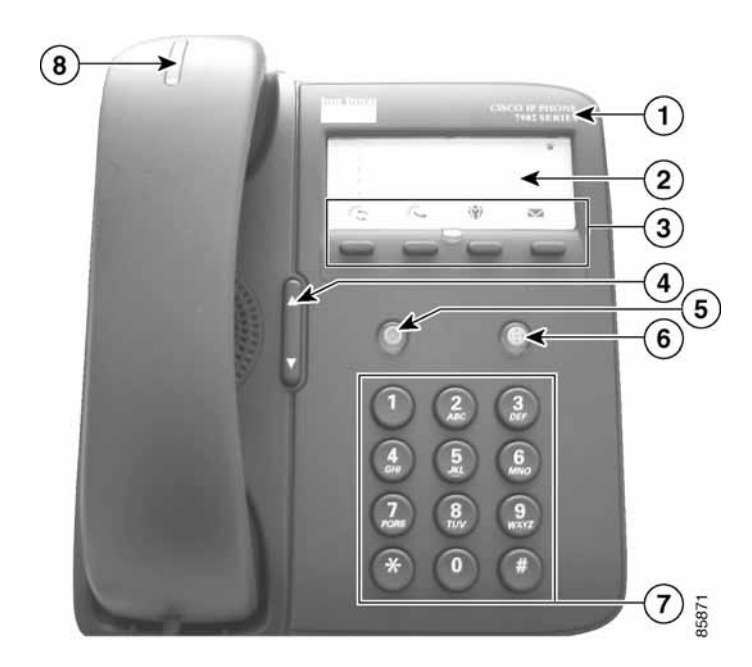
Figure 1-1 Cisco IP Phone 7902G Features

The main components of the Cisco IP Phone 7902G are shown in Figure 1-1.