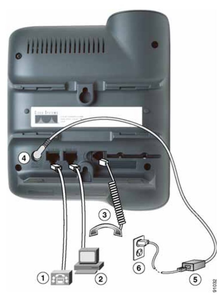
Figure 3-2 Cisco IP Phone Model 7912G Cable Connections