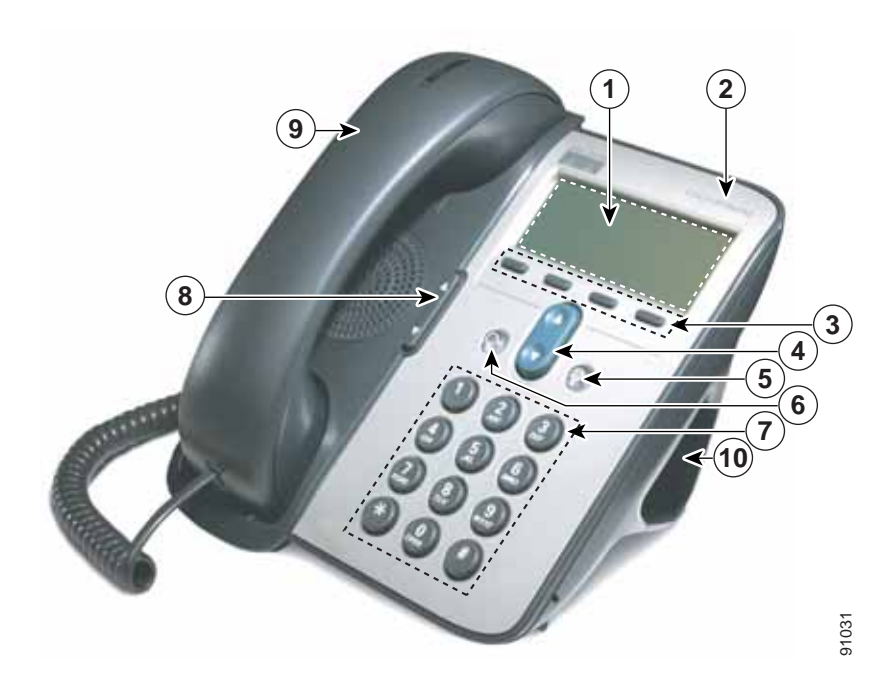
Figure 1-2 Cisco IP Phone Models 7905G/7912 Features