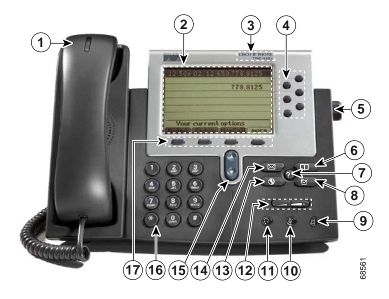
Figure 1-1 Cisco IP Phone 7960