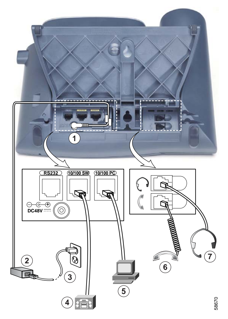
Table 1-1 Cisco IP Phone cable connections