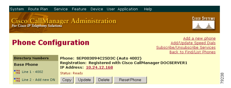
Figure 45-1 Phone Configuration Window

Step 7 Reset the phone after making changes to apply the new settings. See the "Resetting a Phone" section on page 45-8.