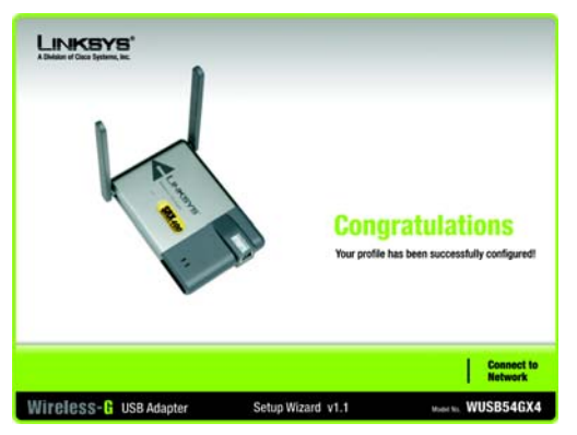
Figure 5-18: Congratulations Screen

Chapter 5: Using the Wireless Network Monitor Creating a New Profile