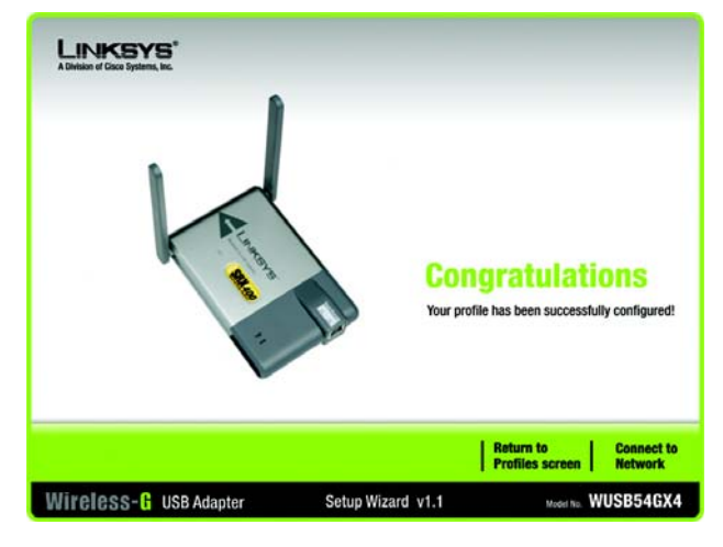
Figure 5-32: Congratulations Screen

Congratulations! The profile is complete.