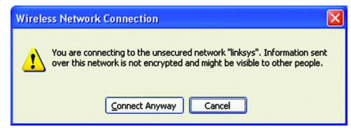
Figure B-5: No Wireless Security

Appendix B: Using Windows XP Wireless Zero Configuration