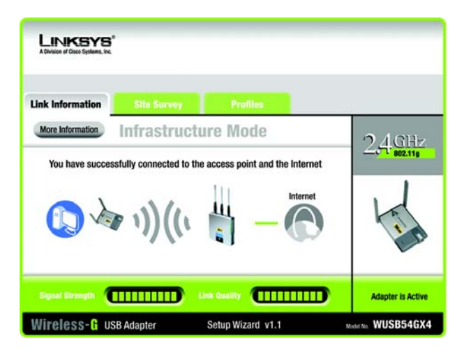
Figure 5-2: Link Information Screen

Figure 5-1: Wireless Network Monitor Icon