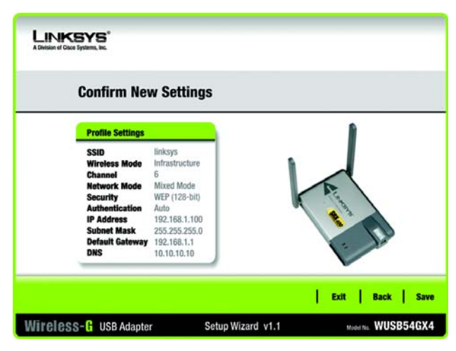
Figure 4-22: Confirm New Settings Screen

5. The next screen displays all of the Adapter's settings. If these are correct, click Save to save these settings to your hard drive. If these settings are not correct, click Back to change your settings.