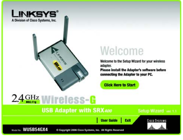
Figure 4-1: Setup Wizard's Welcome Screen