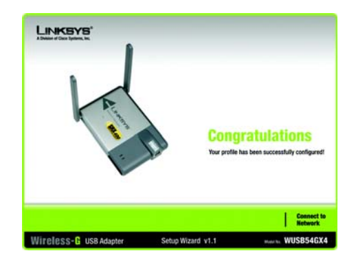
Figure 4-9: Congratulations Screen