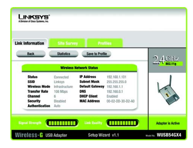
Figure 5-3: More Information - Wireless Network Status Screen

Click the Back button to return to the initial Link Information screen. Click the Statistics button to go to the Wireless Network Statistics screen. Click the Save to Profile button to save the currently active connection settings to a profile.