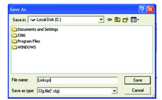
Figure 5-11: Export a Profile

Chapter 5: Using the Wireless Network Monitor Profiles