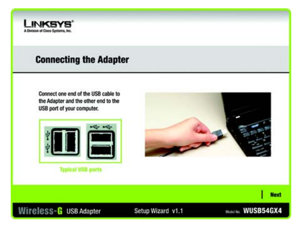
Figure 4-3: Connecting the Adapter Screen