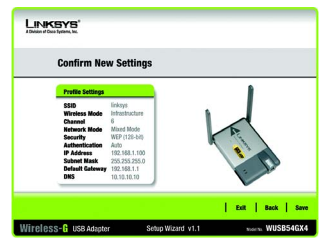
Figure 5-31: Confirm New Settings Screen

5. The next screen displays all of the Adapter's settings. If these are correct, click Save to save these settings to your hard drive. If these settings are not correct, click Back to change your settings.