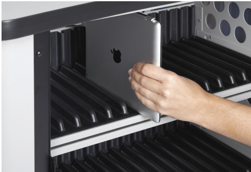
Figure 3-1. Sliding an iPad into a tray in the cart.

STEP 4: Now that each iPad is configured, slide the iPads into the trays within the cart, as shown in Figure 3-1.