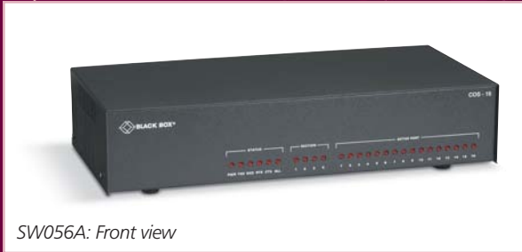
SW056A: Front view