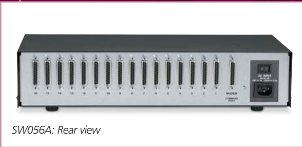
SW056A: Rear view