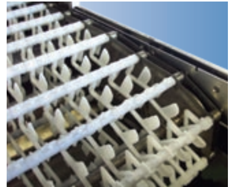
1/2" diameter stainless steel conveyor rods and stainless rollers are standard.

■ All Stainless Steel Main Frame... Resists corrosion in damp dishrooms and provides years of trouble-free service!