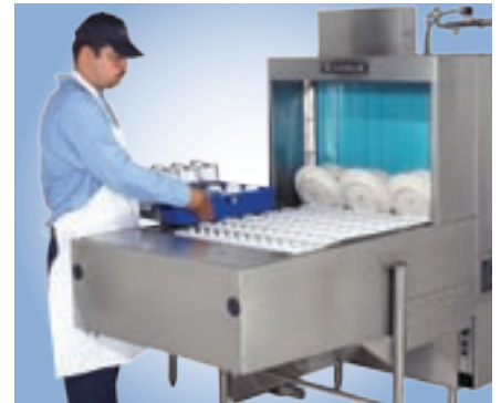
Underslung belt link design allows easy slide-on rack loading from end or either side.