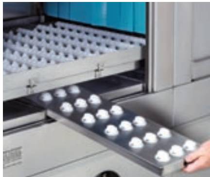
One piece lower spray box and upper manifolds have no loose parts and are easy to remove for cleaning.