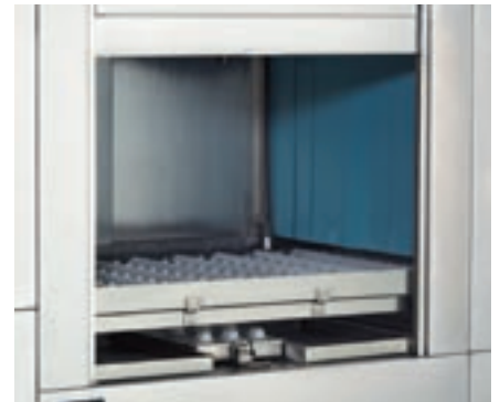
Large 30" wide lift-up/off tank doors provide easy access for tank and component cleaning.