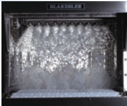
Top and bottom mounted water jets provide torrential cleaning & rinse action.