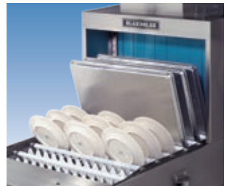
Flat, "no-incline" belt design reduces unit height, simplifies and speeds ware loading.