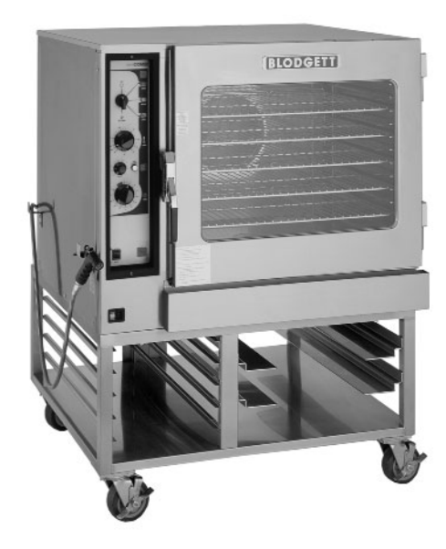
Shown with optional floor stand and casters

Single or Double Gas Boilerless Combination-Oven/Steamer