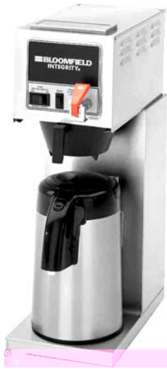
Automatic Brewer Model 8773 w/optional 8881 Airpot

Includes Instructions for Brewing Coffee, Cleaning the Brewer and Deliming the Water Tank