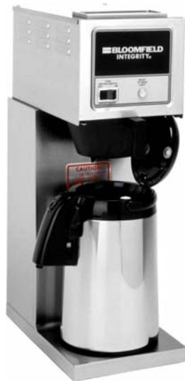
Pour-Over Brewer Model 8774 w/optional 8881 Airpot