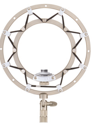
music vocals, guitars, drums, strings, brass, woodwinds