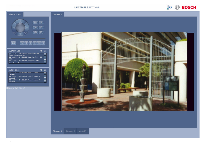
Figure 3.1 Livepage

Other information may also be shown next to the live video image. The items shown depend on the settings on the LIVEPAGE Functions page.