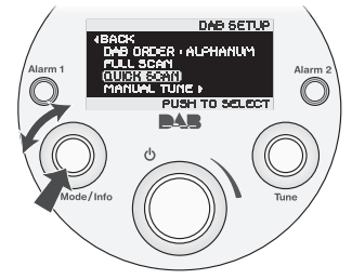
This example shows Quick Scan highlighted for selection.

first. Multiplex - displays stations in Multiplex order. Full Scan: Searches all 64 frequencies in the Band III and L Band