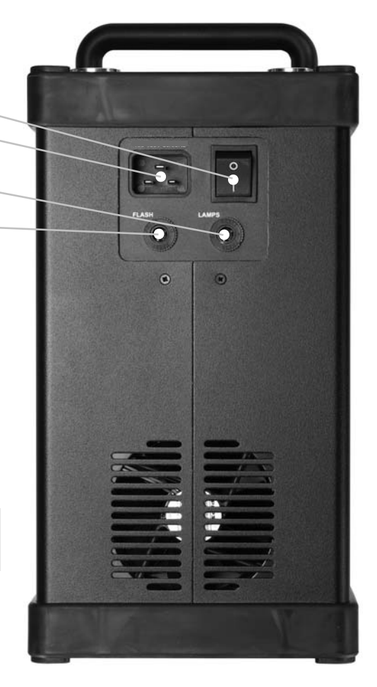
The AC Inlet, On/Off Switch and Thermal Reset Buttons are mounted on the rear panel.

3 The Fast/Slow Switch, Overall Power Selector and Modelling Mode Selector are common to both channels.