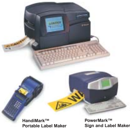
HandiMark™ Portable Label Maker