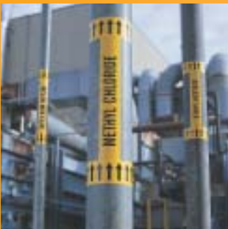
Outdoor Pipe Marking

Maintenance...Operations...Facilities ID...Predictive Maintenance...Ele