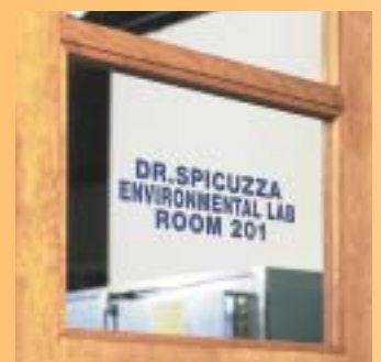
Cut Characters & Shapes