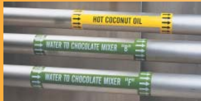
Polyester Pipemarkers for Stainless Steel Surfaces