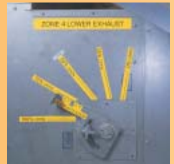
Air Duct I.D.