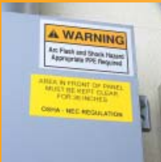
Multicolor Signs & Labels