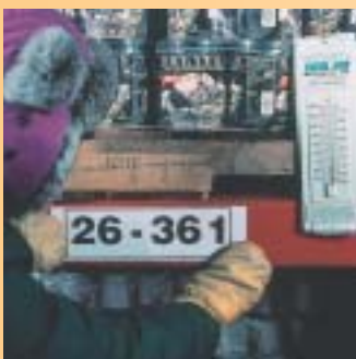
Cold Temperature Material