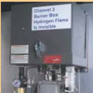
I & E Labeling