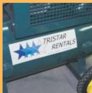
Blended Color Printing