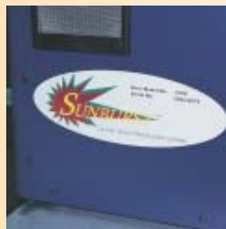
OEM Labels/Rating Plates