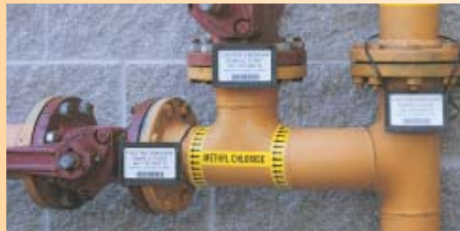
Tags for Fugitive Emission Test Points