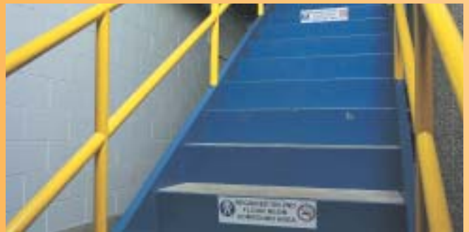
Place Your Message Where You Need It

Maintenance...Operations...Facilities ID...Predictive Maintenance...Ele