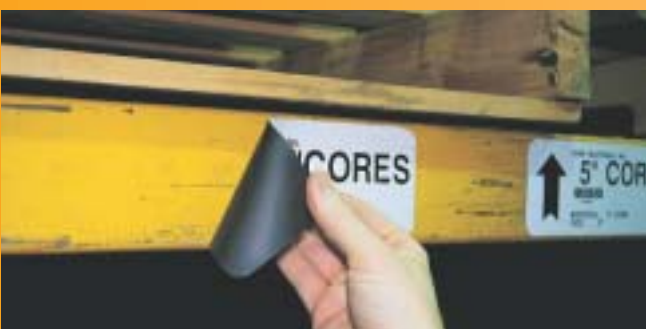
Print Directly to Magnetic Material

Logistics...Building & Grounds...Warehouse...Traffic Control