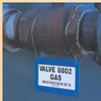
Color-Coded Valve Tags