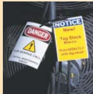
Print Directly to Tag Stock