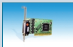
Standard Profile, 4x9Pin: UC-701