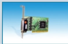
Standard Profile, 4x25Pin: UC-265

Brainboxes has a solution for every niche of the 4 port market. Alternative connector see: UC-268 & UC-265 STREAMLINEconnector see: UC-420 & UC-836