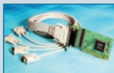
Low Profile, 4x9Pin: UC-260