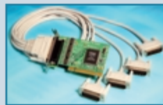
Low Profile, 4x25Pin: UC-271