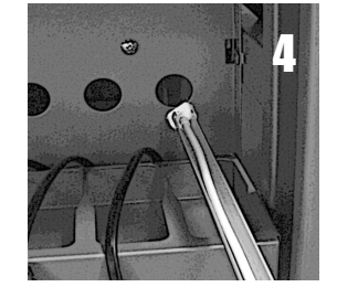
Thread the loaded Cable Wand through the hole above adapter holder