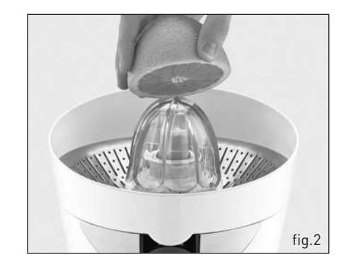
the juicing cone will begin to rotate. To stop, lift the fruit off the cone. Juicing will automatically stop.