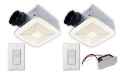
SMSK102 Kit contains Broan Ultra Silent<sup>™</sup> fans (one 110 CFM fan, one 80 CFM fan), two Broan SmartSense® controls and a phase coupler. Includes white and almond colored paddles.