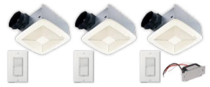
SMSK103 Kit contains Broan Ultra Silent<sup>™</sup> fans (one 110 CFM fan, two 80 CFM fans), three Broan SmartSense<sup>®</sup> controls and a phase coupler. Includes white and almond colored paddles.