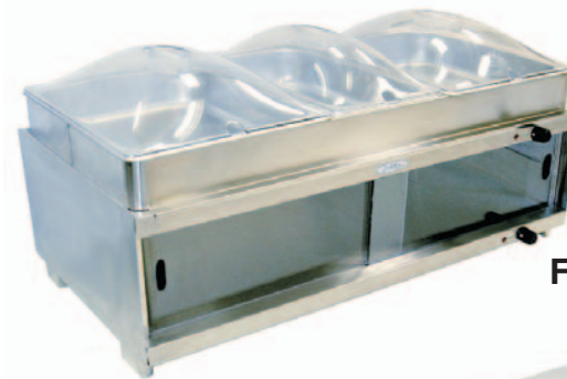
Model MLB-CSLP Warming Cabinet with Family Size Buffet Server