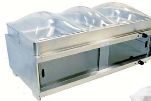
Model MLB-CSLP Warming Cabinet with Family Size Buffet Server