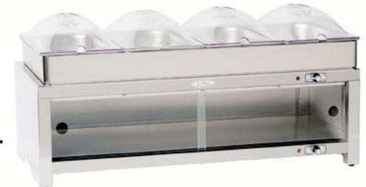
Model MLB-CSLP4 Warming Cabinet with Family Size Buffet Server