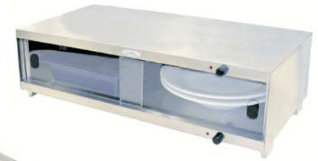
Model MLW-C Warming Cabinet with Family Size Warming Tray (plates not included)