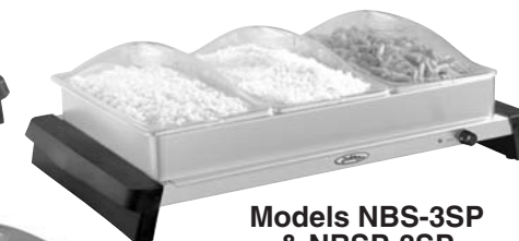
Models NBS-3SP & NBSP-3SP