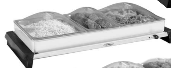
Models NBS-3SLP & NBSP-3SLP