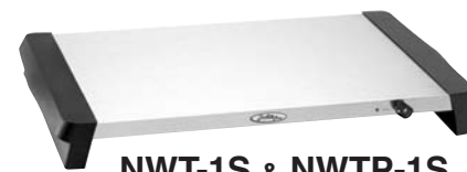
NWT-1S & NWTP-1S