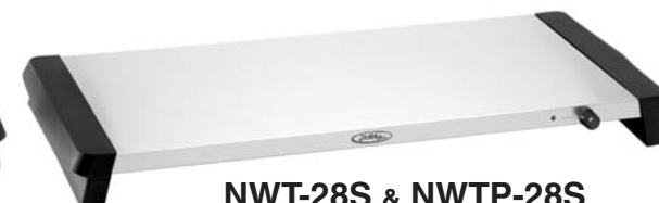
NWT-28S & NWTP-28S