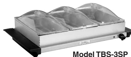
Model TBS-3SP (with clear lids)

Models TBS-5S, TBS-4S, TBS-3, TBS-3S, TBS-3SP, TBS-2S