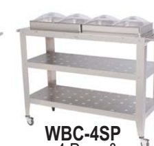
WBC-4SP 4 Pans & 4 Individual Lids