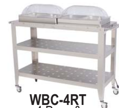
WBC-4RT 4 Pans & 2 Rolltop Lids

4 Pans & 4 Individual Lids 1 Cutting Board