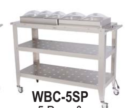
WBC-5SP 5 Pans & 5 Individual Lids

WBC-4RT, WBC-4SP, WBC-5RT WBC-5SP: 400 Watts / 3.4 amps / 120 Volts / 60 Hz 2 Temperature Controls (one per side: total active heat area: 43" x 15")