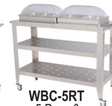
WBC-5RT 5 Pans & 2 Rolltop Lids