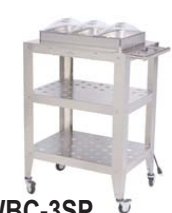
WBC-3SP 3 Pans & 3 Individual Lids

WBC-2RT, WBC-2SP, WBC-3RT WBC-3SP: 200 Watts / 1.7 amps / 120 Volts / 60 Hz 1 Temperature Control (active heat area: 22-1/8" x 15")