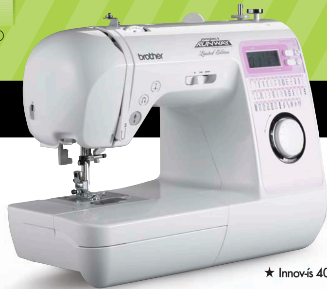
★ Innov-ís 40

Whether you're new to fashion sewing or a skilled veteran of the fitting room, you'll love the creative potential the Innov-ís 40 brings to your design table. Dream it, then do it with the Innov-ís 40's wide array of decorative stitches and convenient machine features. Made by Brother, powered by your imagination!