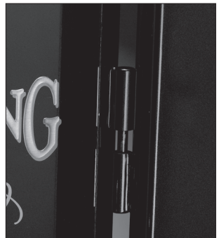
Door must be clear of frame to remove. Lift straight up to avoid damaging bolts.

1 With two or more people supporting the door, position the door hinges above the pins on the bottom hinge pieces on the safe.