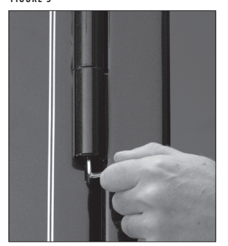
Adjusting the hinges.