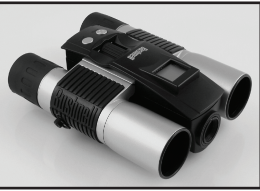
Model#: 118213 LIT. #: 98-0795/07-06